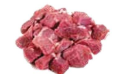
Diced Lamb, Mutton, Chevon