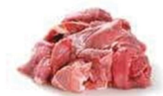
Trimming Lamb, Mutton, Chevon