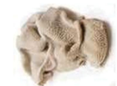
Tripe Lamb, Mutton, Chevon