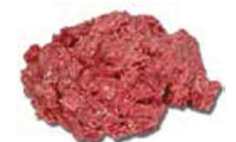
Minced Lamb, Mutton, Chevon