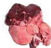
Pluck Lamb, Mutton, Chevon