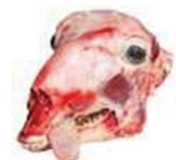
Head Lamb, Mutton, Chevon